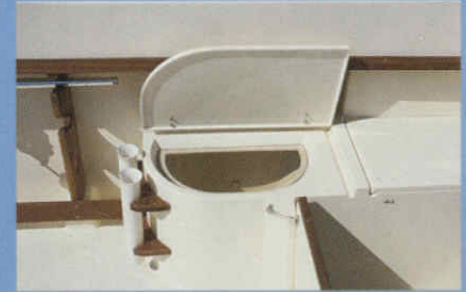
Insulated fish box w/optional livewell