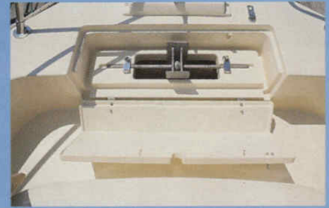
Bow anchor locker