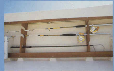
Horizontal rod racks