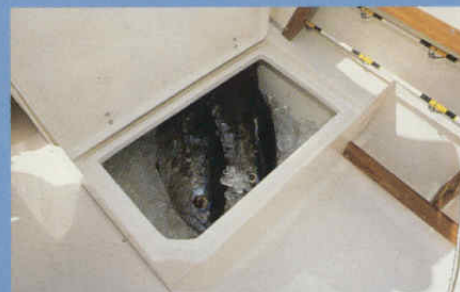
Insulated fish box