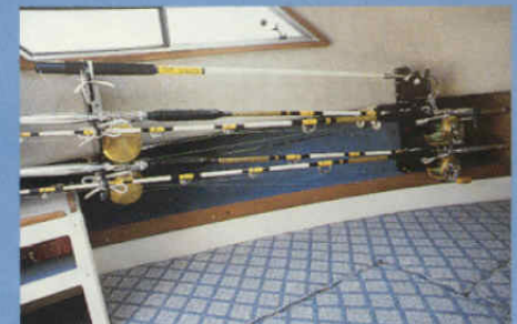
Cabin interior w/optional rod racks